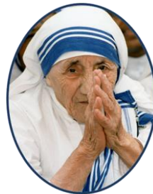
St Teresa of Kolkata Mother Teresa

We ask this prayer through Christ our Lord. Amen